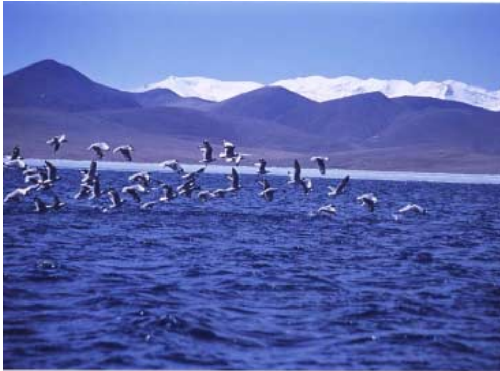
Lake Puma Yumco 5070 meters above sea level