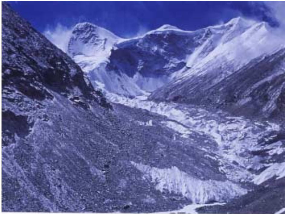
Khula Kangri – East, Central and Main Peak from left to right